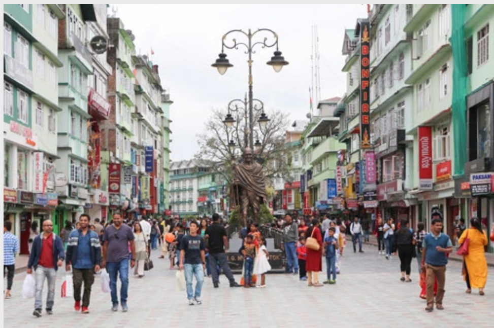
MG Road, Gangtok