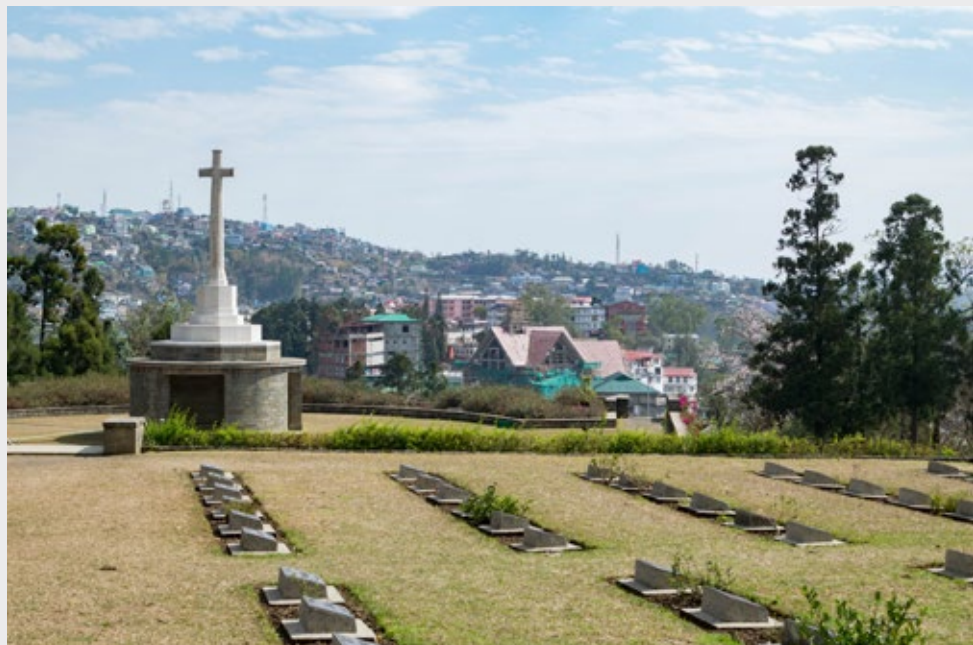
Kohima War Cemetery