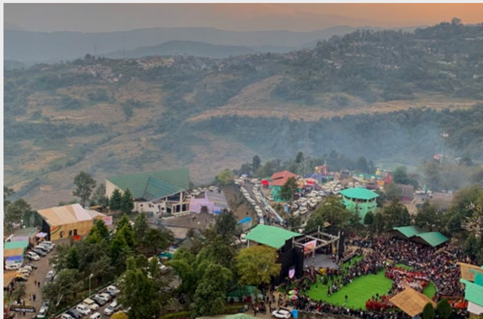
Kisama Heritage Village